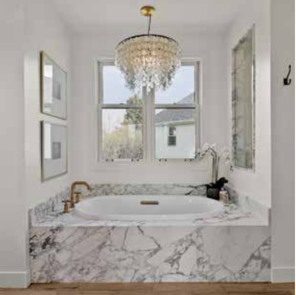
SNAP SQUAD PHOTOGRAPHY

After the consult, we put a custom estimate together to review with you and if all looks good, we schedule a start date! To learn more about our process, check out our website! We look forward to connecting with you! www.redesignstudio.ca