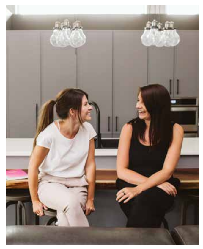
EMILY & ROBYN

We offer our clients a range of services that are tailored to suit their project. Whether you need help curating the look you already love or need us to develop a custom design just for you from scratch, we help to simplify the design experience from start to finish!